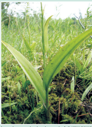
Non-flowering plant © MEGAN CROWLEY Lower leaves and reduced upper leaf © MEGAN CROWLEY